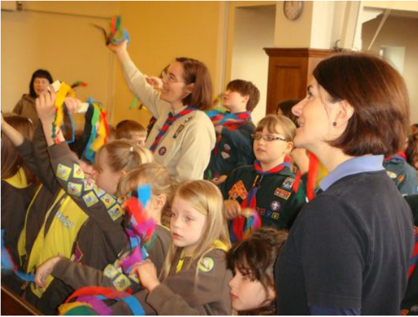
Scouts and Brownies welcoming Jesus on Palm Sunday